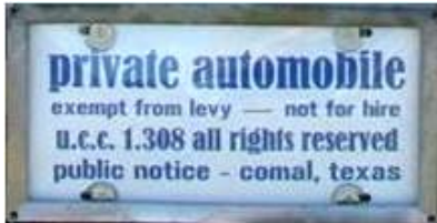
(U//LES) ROT License Plates

(U//LES) ROT license plates vary from professionally produced plates to a piece of paper with printing. License plates may indicate “Do not detain.”