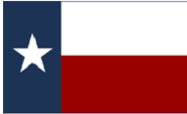
(U//FOUO) Texas republic Admiralty