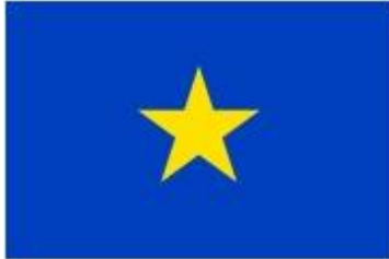
(U//FOUO) Texas republic National Standard