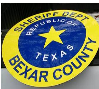
(U//LES) ROT Magnetic Vehicle Emblems

(U//LES) In December 2009, the Kerrville, Texas, Police Department seized ROT magnetic vehicle emblems from an identified US person’s vehicle (USPER1). During the interview, USPER1’s father (USPER2) arrived on the scene. USPER2’s vehicle also displayed ROT magnetic vehicle emblems. The officers seized USPER2’s magnetic emblems.